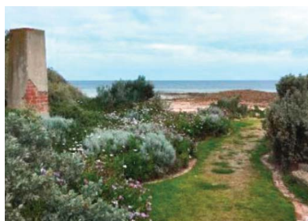
Secret Garden - Kemp Place, Moonta Bay