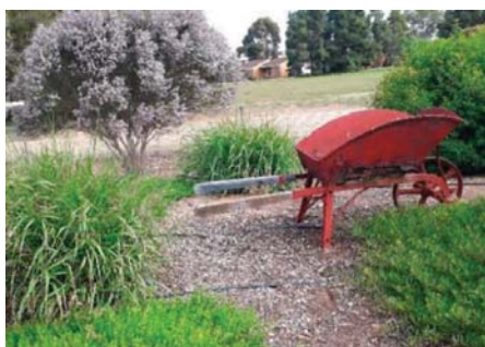
Men's Shed - Military Road, Moonta