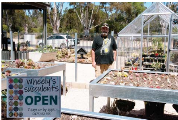
'Wheely', Milne Terrace

Thanks go to all those who generously offered their gardens for public viewing as part of the Open Gardens Festival, some of whom appear below.