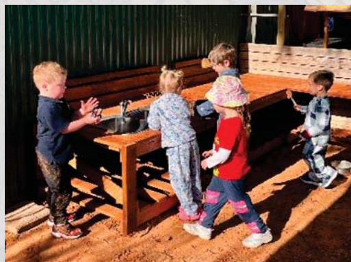
Children enjoying playing at the Mud Kitchen

We service the Northern Yorke Peninsula, including Kadina, Moonta and Wallaroo.