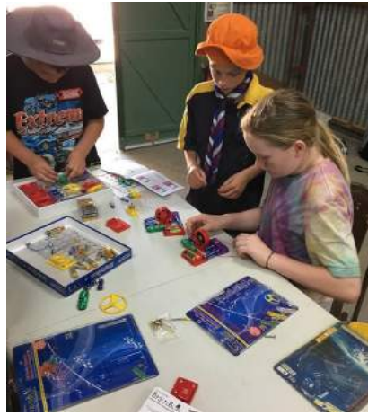
Moonta cubs benefit from grant to upgrade scout hall

The grants will be matched dollar for dollar, mostly through in-kind labour to complete the projects, so there will be some extra busy volunteers working over the next twelve months to improve our community.