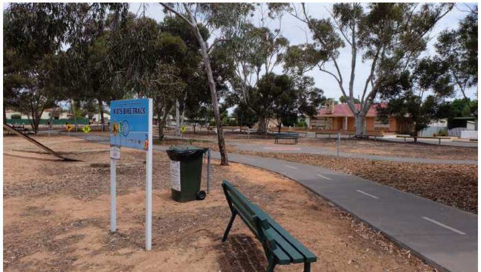
Kid's bike track, Polgreen Park, Bay Road, Moonta

Splashing and sliding at Splash Town 12noon - 5pm every day in the holidays (exc Christmas Day) Bay Road Moonta Bay, at the jetty end. Shaded picnic tables and public toilets nearby.