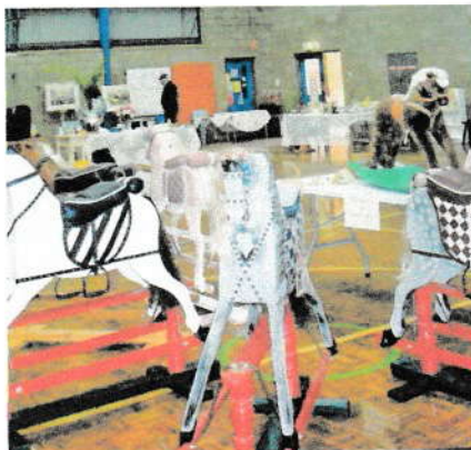
A rocking horse collection on show at the Parkview collectors' fundraiser.