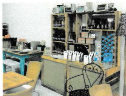
Top: Boudica Moonterra moved to George Street.